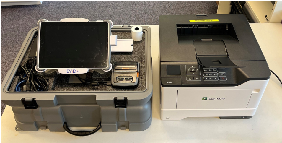
The Supervisor of Elections Office is rolling out some new technology for in-person voting on Election Day: new Electronic Voter Identification (EViD) machines, left, and Ballot on Demand printers.

No more picking-and-pulling ballots for election workers. The BOD printers will automatically print the voter's correct ballot style after checking in using the EViD. Printing ballots on demand will make processing voters more efficient on Election Day.